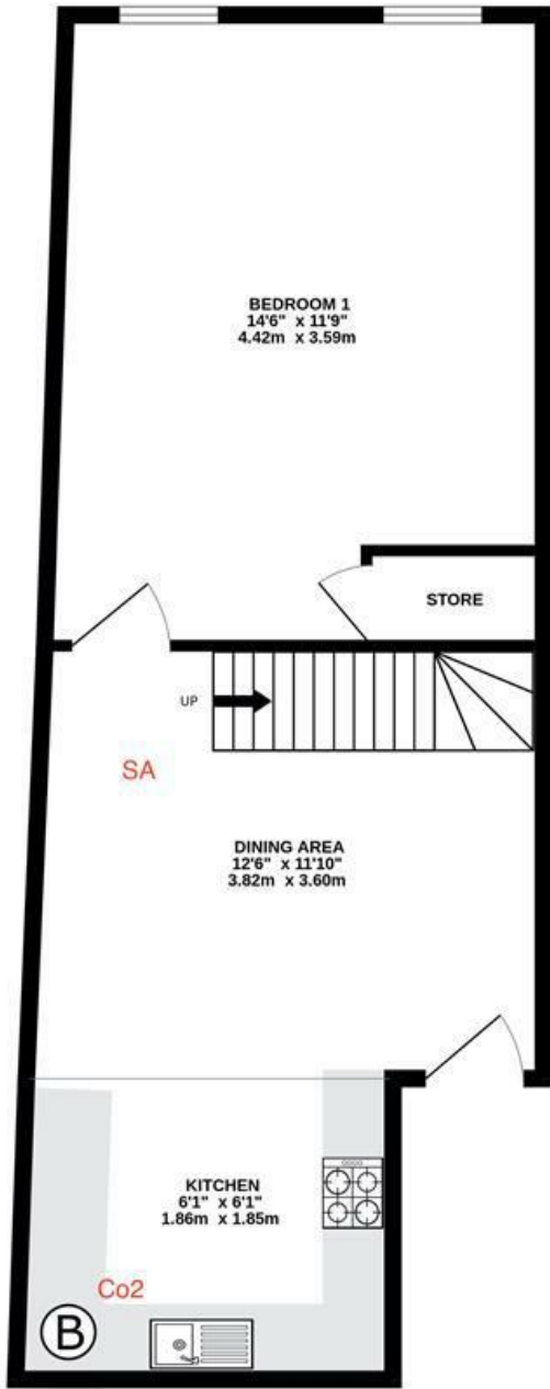
GROUND FLOOR 377 sq.ft. (35.0 sq.m.) approx.